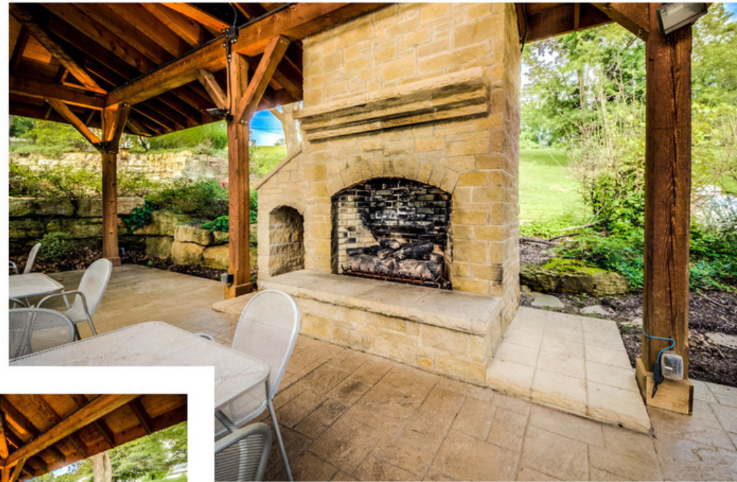
Banquet Area with Heavy Electric & Outdoor Lighting Beautiful Landscaping for those Special Pictures