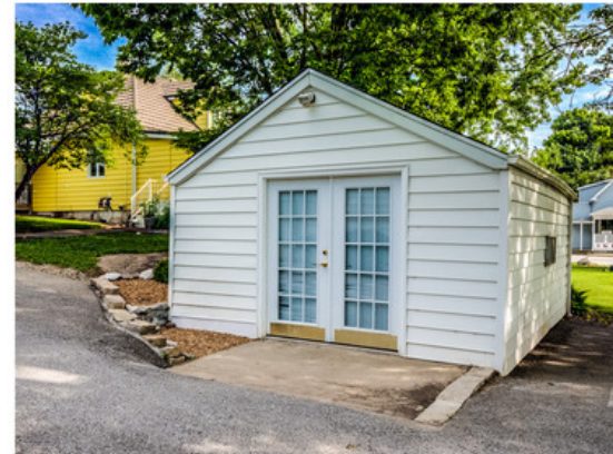
Wine Making Area