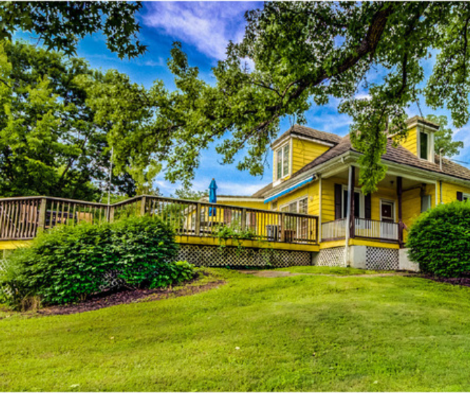
Yellow Farm House sits on 6.99 Acres

Zoned Heating & Cooling · Basement Dirt Floor · Two Bathrooms · Fireplace in Master upstairs One Bedroom Home · Large Outside Deck · Zoned C-2 · Public Water · Water District #2 · 3 Total Septics