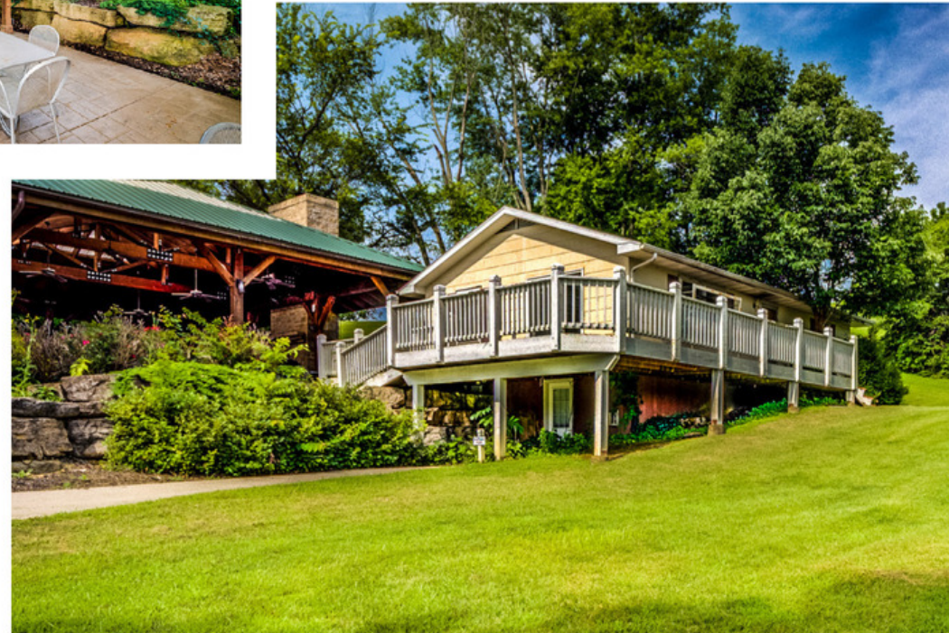
Catering Home and Yard