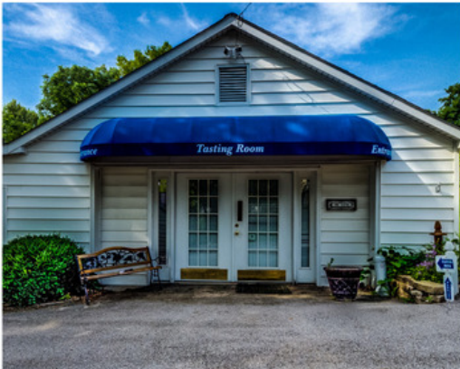
Tasting Room & Storage

Remodel Outside Paint Has Warranty Two Smoke Houses Central Air and Heat 7 years old Metal Roof New Kitchen Newly Painted Inside Large Front Porch With a View of the Bottoms