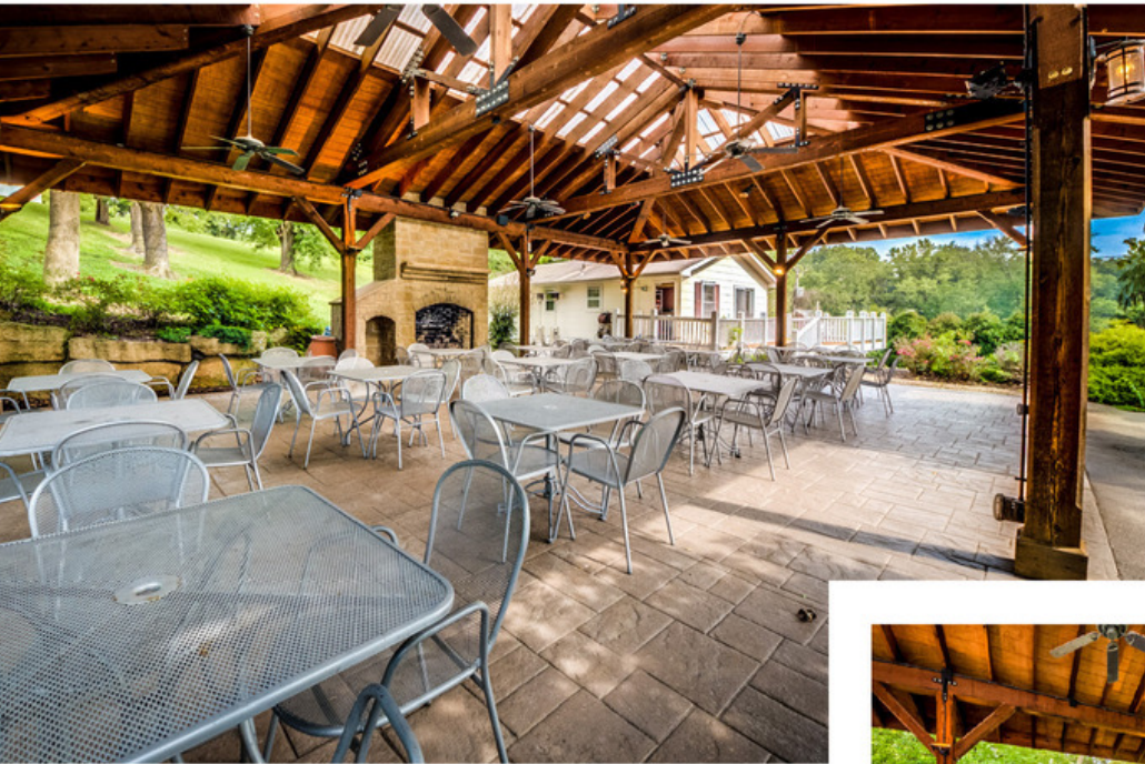
Banquet & Catering Home - Massive Stone Fireplace

Seats 100 People w/ Round Tables · Propane/Wood Fireplace · Stage Lighting · Heavy Electric